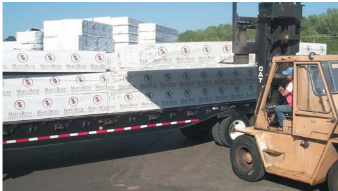
A truck load of Mary's River Western Red Cedar Siding is assembled at the Corvallis shipping yard.

Our Shiplap Siding is available either unseasoned or as a premium KD grade.