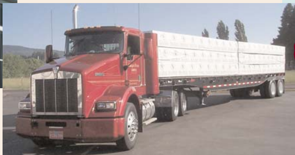
A truck load of Mary's River Western Red Cedar Boards are shipped from our Corvallis finishing plant.

Mary's River Red Cedar Board is available in various widths and lengths to accommodate almost any fascia and trim requirement.