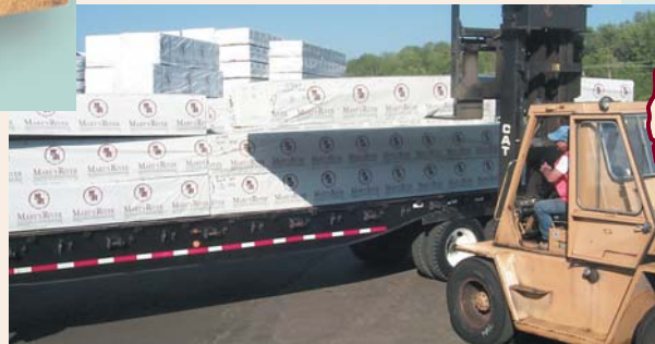
Building a truck load of Mary's River Western Red Cedar Channel at the Corvallis shipping yard.

Mary's River Channel Siding is available in various widths and lengths to accommodate almost every requirement.