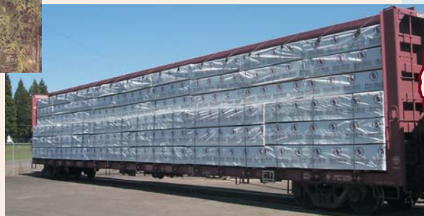
An A-Frame rail car is ready for shipment at the Mary's River shipping yard in Corvallis, Oregon.