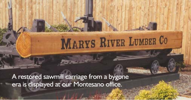
A restored sawmill carriage from a bygone era is displayed at our Montesano office.