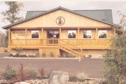
Mary's River sales and administration office in Montesano, Washington.

Mary's River staff is committed to unmatched customer service. Our sales support team is attentive and responsive to the needs of our customers, working with production to get specific tallies shipped for arrival when the customer needs it. You can depend on Mary's River to deliver the best Western Red Cedar available.