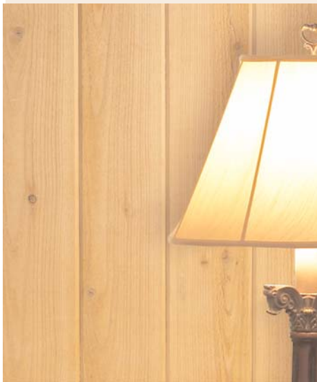
Mary's River Tongue & Groove Paneling adds warmth, depth and richness to any room decor.

Mary's River Tongue & Groove is backed by our commitment to the highest standards in product quality and customer service. You can depend on Mary's River, the Western Red Cedar industry leader through innovation and outstanding service.